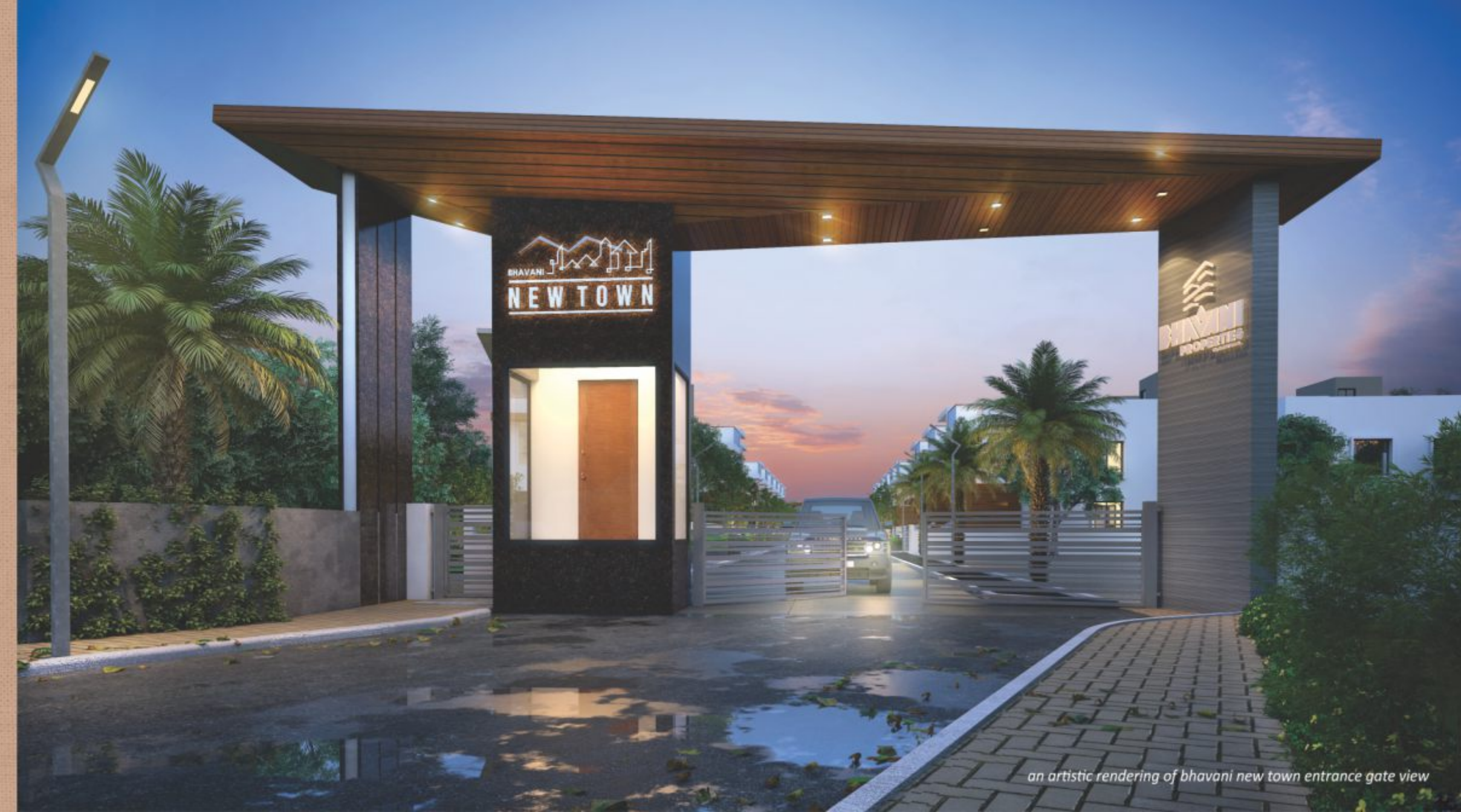
an artistic rendering of bhavani new town entrance gate view