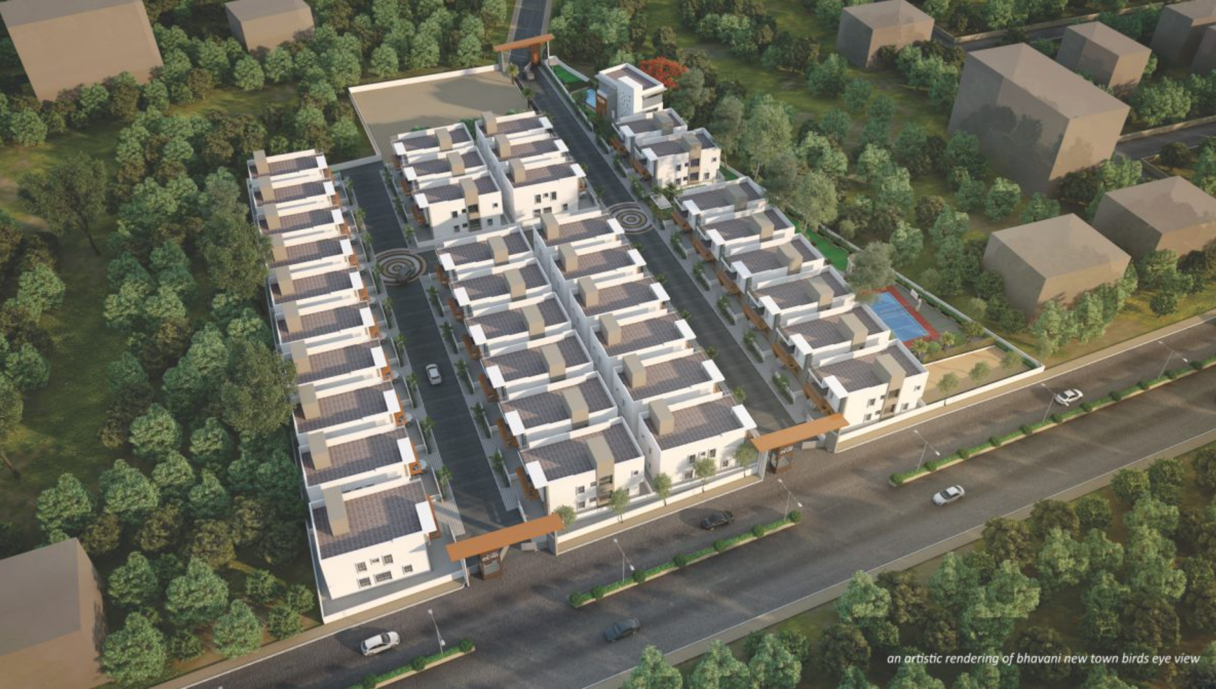
an artistic rendering of bhavani new town birds eye view