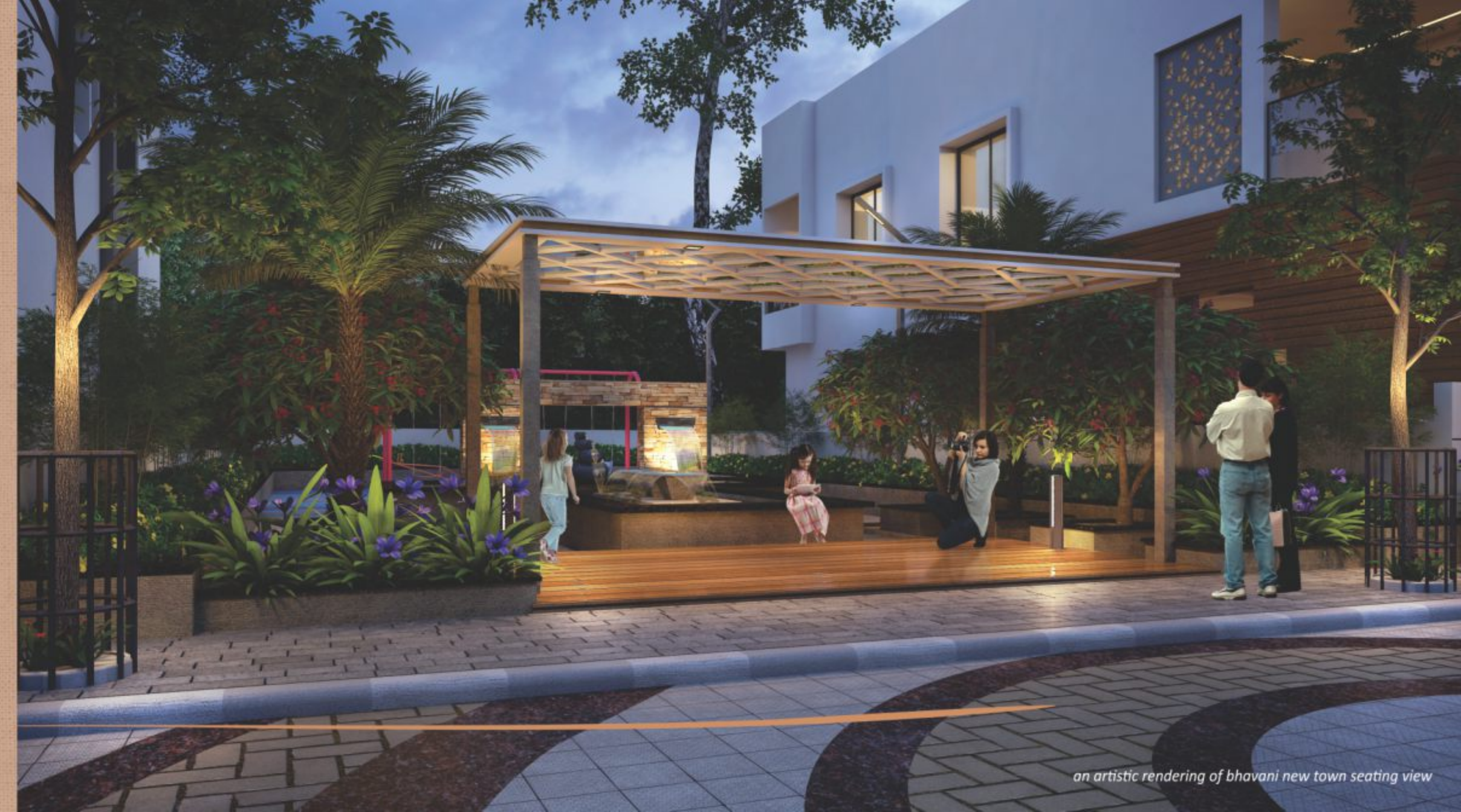
an artistic rendering of bhavani new town seating view