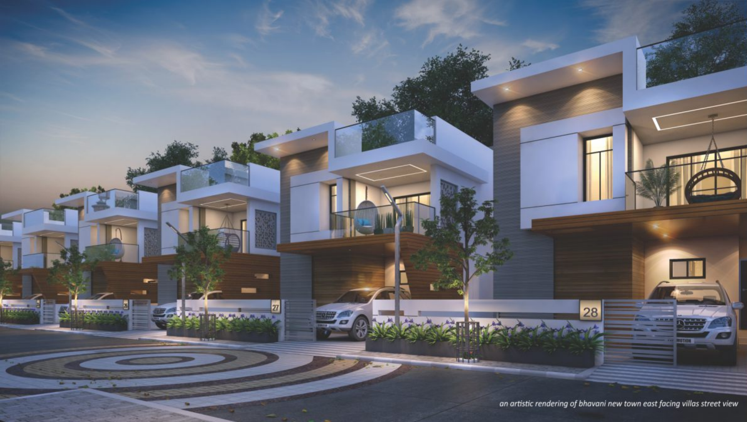
an artistic rendering of bhavani new town east facing villas street view