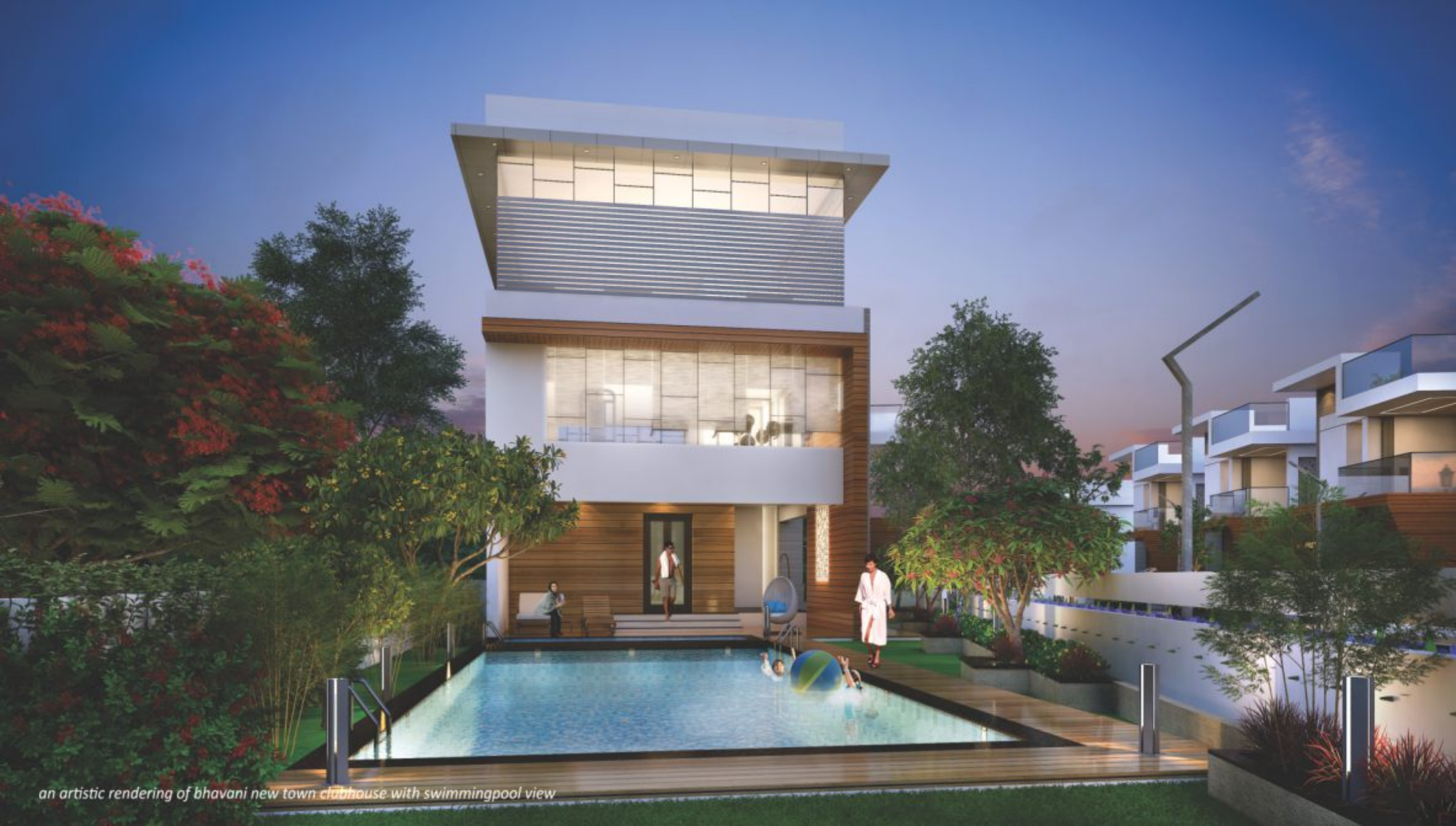
an artistic rendering of bhavani new town clubhouse with swimmingpool view