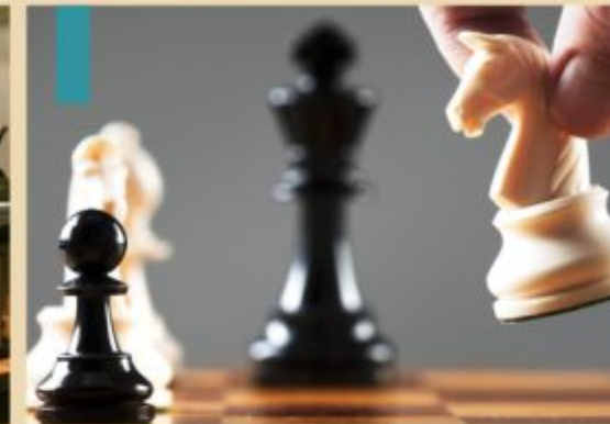
CHESS AND CAROMS