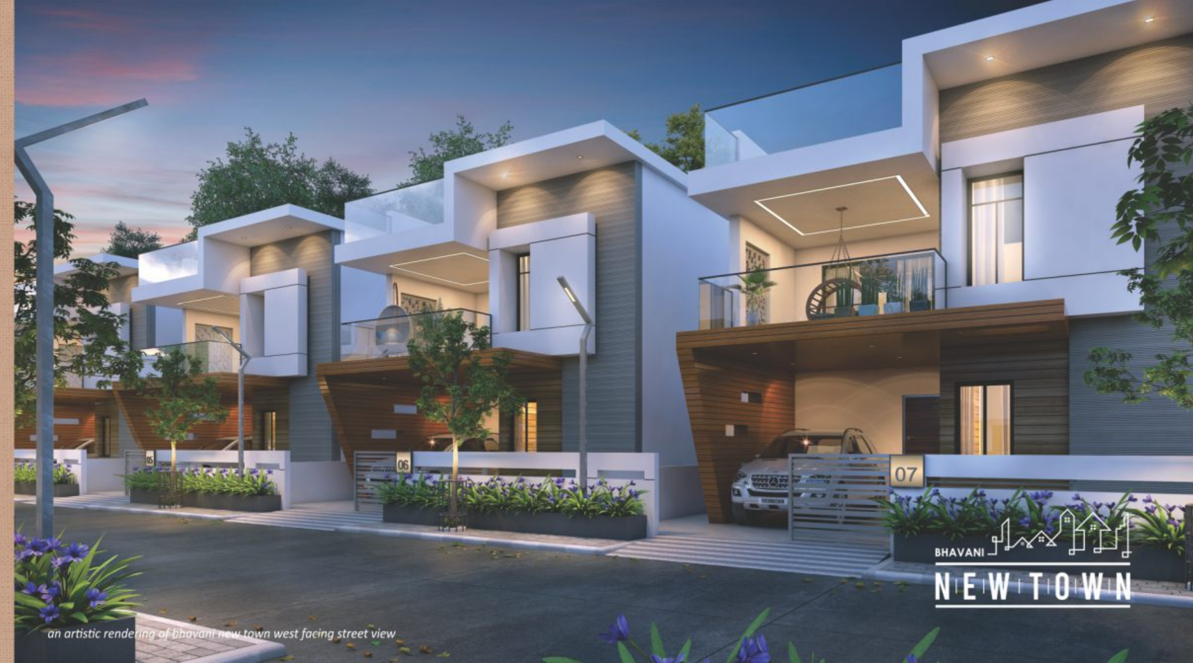
an artistic rendering of bhavani new town west facing street view