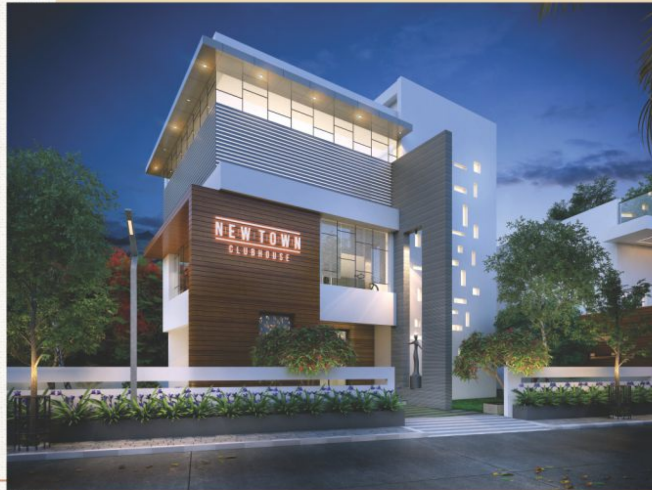
an artistic rendering of bhavani new town clubhouse view